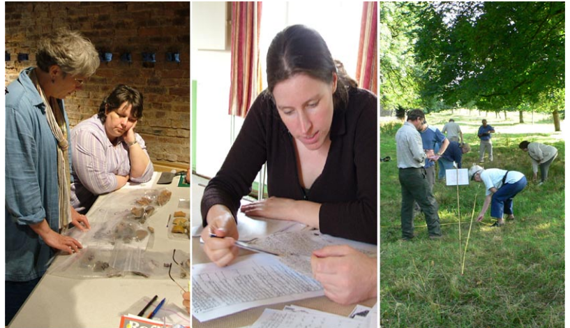
Workshops in finds identification, palaeography and field survey

Since the project began in March 2005 there has been an increase in the number of communities investigating their local heritage. Groups have continued to explore local archaeology in a number of areas around York – a prehistoric landscape in Dunnington, a medieval village in Heslington, a battlefield in Fulford, pottery in Poppleton and the Knights Templars in Copmanthorpe. New groups have sprung up in Dringhouses, Strensall and Wigginton, igniting interest and enthusiasm among local communities. There are lots of areas of York that could do really interesting projects but have not had the impetus or resources to carry them out. Now the opportunity to explore your past is greater than ever. The past is there to be discovered so what are you waiting for?!